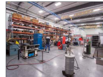
Sadler Power Train, Davenport