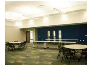
Mt. Mercy-CRST Grad Cntr