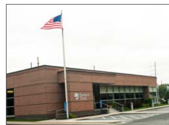
Bankers Trust - Blairs Ferry