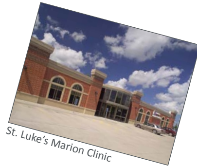
St. Luke's Marion Clinic