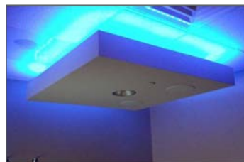
St. Luke's PET-CT Suite