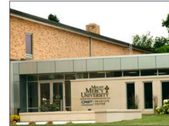
Mt. Mercy-CRST Grad Cntr