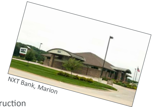
NXT Bank, Marion

Esco Electric: pre-construction services, electrical design, self-performed/managed all electrical installations