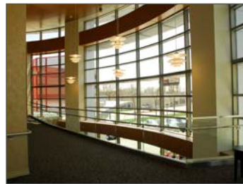
St. Luke's Hospital

Esco Electric: pre-construction services, self-performed/managed all electrical installations