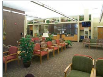
St. Luke's Marion Clinic

Esco Electric: pre-construction services, value engineering, self-performed/managed all electrical installations