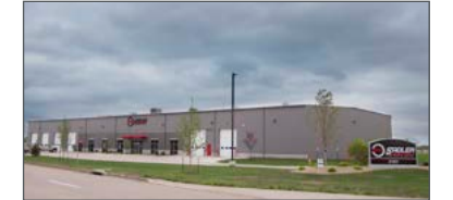
Sadler Power Train, Davenport

Esco Electric: pre-construction services, electrical design, self-performed/managed all electrical installations