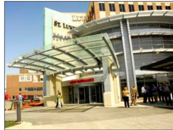
St. Luke's Hospital

Esco Electric: pre-construction services (assist RTKL), value engineering, self-performed/managed all electrical installations