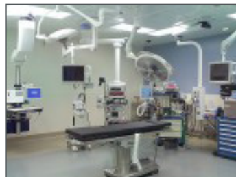
St. Luke's Hospital

Esco Electric: pre-construction services, electrical design, self-performed/managed all electrical installations